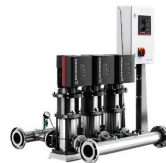
BOOSTER PUMP SYSTEMS