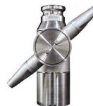
TANK CLEANING MACHINES