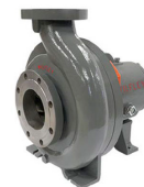
DYNAMICALLY SEALED PUMPS