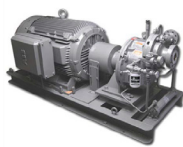
HIGH PRESSURE PUMPS