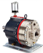
HIGH PRESSURE DIAPHRAGM PUMPS