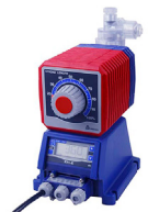
SOLENOID METERING PUMPS