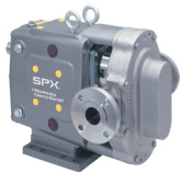
CIRCUMFERENTIAL PISTON PUMPS