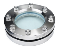
SIGHT GLASSES & VESSEL LIGHTING