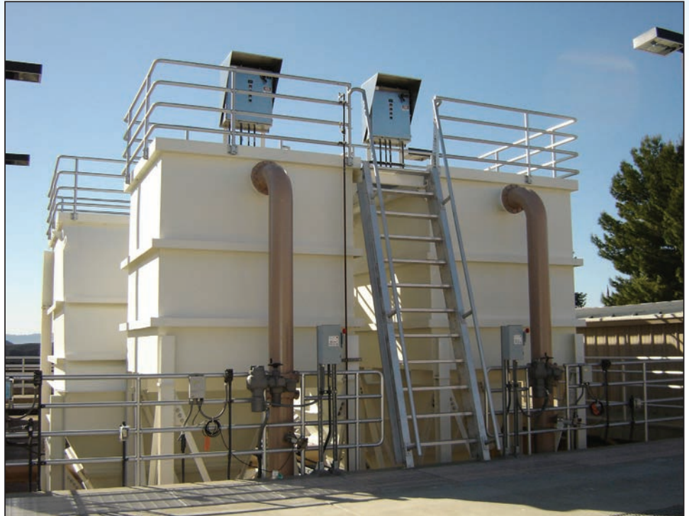
With the help of WesTech's SuperSettler lamella plate clarifiers, CLWA was able to increase total plant capacity while consistently meeting turbidity requirements.

Plant operators are pleased with the performance of the plate settlers. With the help of WesTech's SuperSettler lamella plate clarifiers, CLWA was able to increase total plant capacity, in a small footprint, to 56 MGD while consistently meeting turbidity requirements.