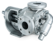
INTERNAL GEAR PUMPS