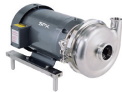
SANITARY CENTRIFUGAL PUMPS