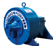
PITOT TUBE PUMPS