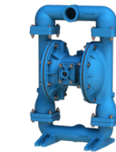
AIR OPERATED DIAPHRAGM PUMPS