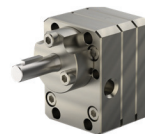
PRECISION GEAR PUMPS