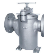
STRAINERS & OTHER FILTER TECHNOLOGIES