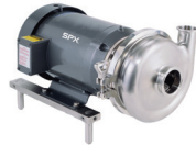
SANITARY CENTRIFUGAL PUMPS