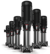
MULTI-STAGE CENTRIFUGAL PUMPS