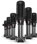
MULTI-STAGE CENTRIFUGAL PUMPS