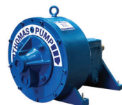
PITOT TUBE PUMPS