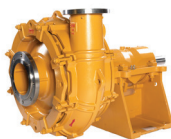
DYNAMICALLY SEALED PUMPS