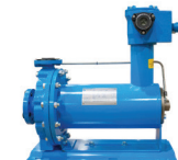
CANNED MOTOR PUMPS