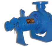
HOT OIL PUMPS