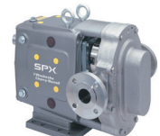
CIRCUMFERENTIAL PISTON PUMPS