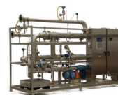
CUSTOM SKID SYSTEMS