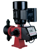
DIAPHRAGM METERING PUMPS