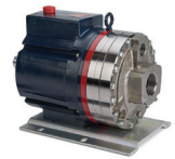
SEALLESS DRY-RUNNING PUMPS