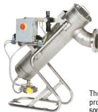
The MCS-500 can process up to 500 gpm

The MCS-1500 is a high-volume system with a flow rate of up to 1500 GPM.