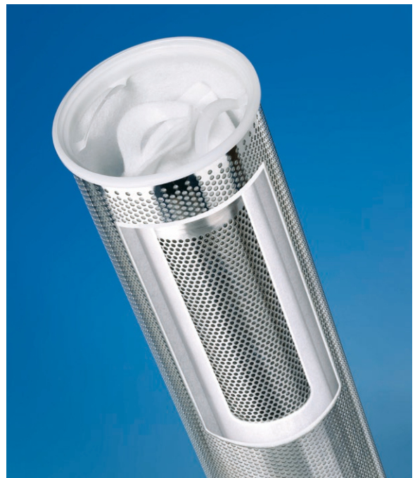
Eaton's HAYFLOW Model Q Elements – High capacity extended life needle felt with ultrafine nylon mesh outer cover