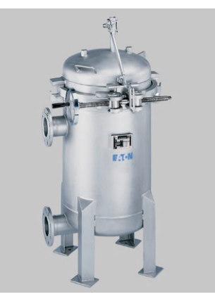
Eaton MAXILINE VMBF multi-bag filter housings are designed for high-volume applications requiring frequent filter bag changes including batch processes and high-dirt load applications. Their QIC-LOCK opening mechanism facilitates fast and easy filter bag changes to improve productivity and reduce operating costs.

Eaton SENTINEL seal ring lip rings provide a flexible, chemical resistant seal that's adaptable to any filter housing. The pressure activated sealing lip ensures bypass-free filtration over all ranges of pressure, temperature and micron rating and the design simplifies installation and removal.