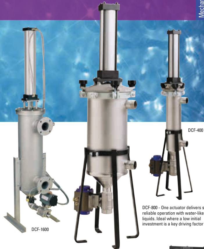
DCF-800 - One actuator delivers simple, reliable operation with water-like liquids. Ideal where a low initial investment is a key driving factor

The Eaton DCF-Series is ideal for highly viscous, abrasive, or sticky liquids. The DCFs operate at a consistently low differential pressure and deliver simple, reliable operation in which a low initial investment is a key driving factor.