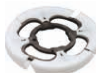
Our unique circular cleaning disc design (MCF design shown) ensures intimate contact with the screen to thoroughly and uniformly clean the media.