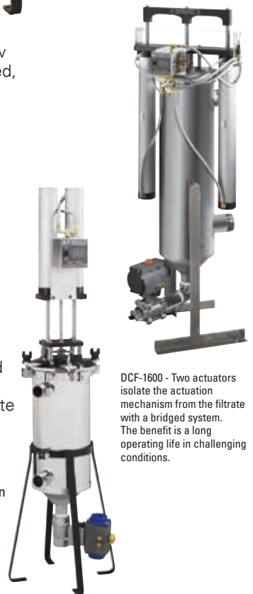
DCF-800 twin actuator model

The DCF-800 and DCF-1600 are also available in twin actuator models, which are designed for the rigors of processing highly viscous, abrasive, sticky, or otherwise hard-to-process liquids. DCF filters are suitable for a broad spectrum of challenging applications and accommodate a wide range of flow and retention requirements.