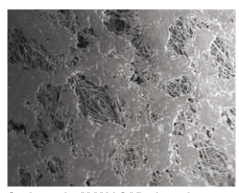
Surface of a MAX-LOAD pleated filter bag