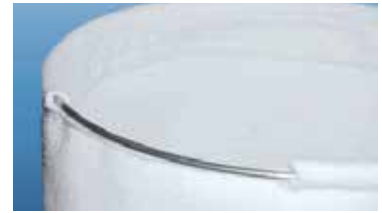
SNAP-RING seal ring