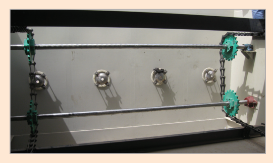
Energy Dissipating Distribution Inlets