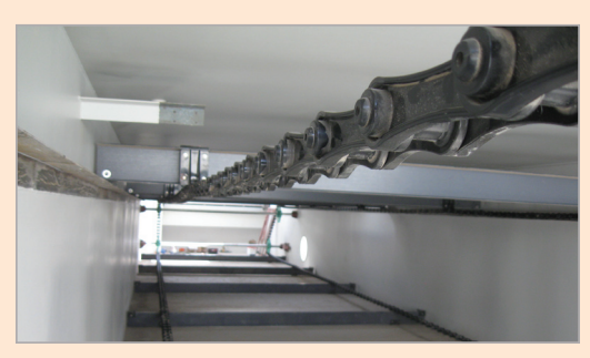
Chain and Flight