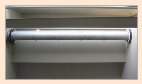
Slotted Rotating Pipe, Skimmer