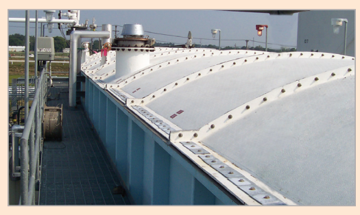
VOC Containment Cover